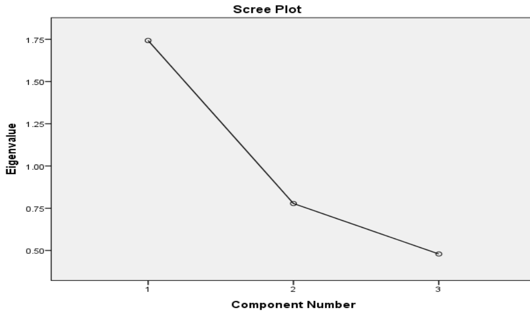
Figure 1: The Scree Plot